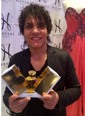
CNN iReport Golden Globes article