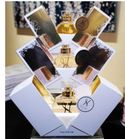
Package Design CITY Award, ICMA