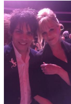
Actress Mélanie Griffith