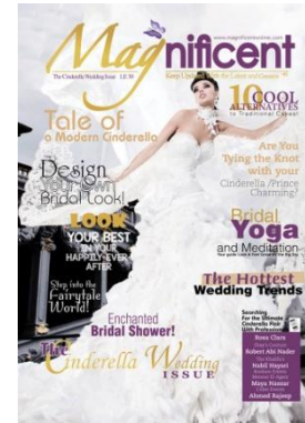
Interview Magnificent Magazine January 2016