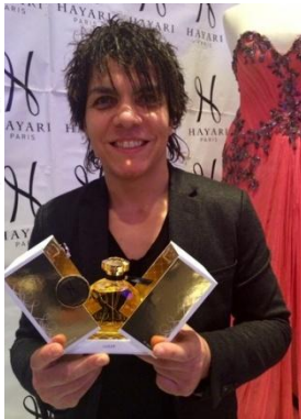
CNN iReport Golden Globes article