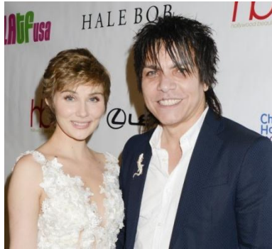
Actress Clare Bowen, Nashville