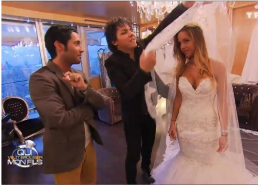
French TV Show Qui veut épouser mon fils?