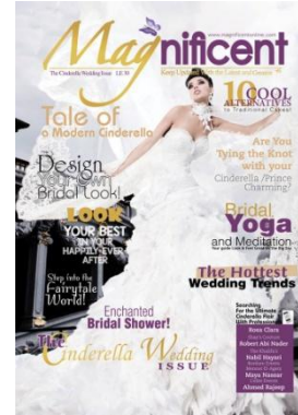
Interview Magnificent Magazine January 2016