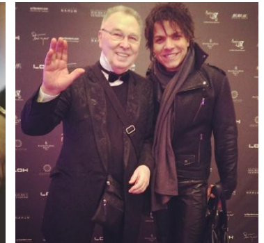
Designer Slava Zaitsev