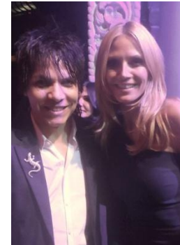
Model Heidi Klum