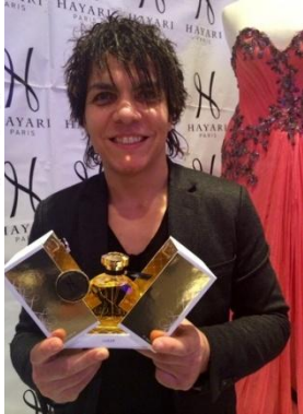
CNN iReport Golden Globes article