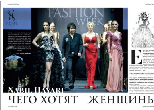
Interview New Style Magazine February 2016