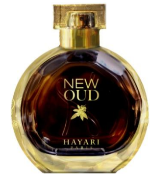
HAYARI PARIS, New Oud