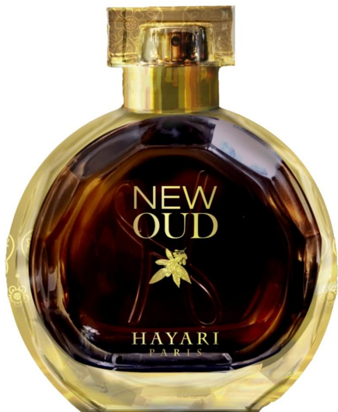
Eau de Parfum (20%) 100 ml/3.4oz, 176€