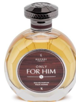
HAYARI PARIS, Only For Him

Masque Fragranze, Tango MDCI, Nuit Andalouse Suléko, *Albho Suléko, Baba Yaga Suléko, Djélem Suléko, Vy Roza Undergreen, Pink