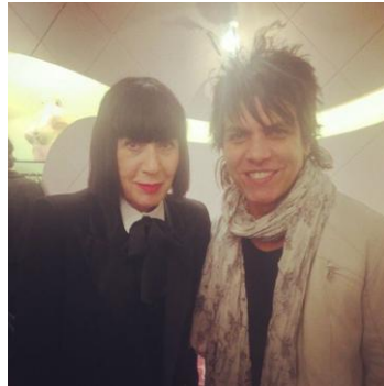
Designer Chantal Thomass