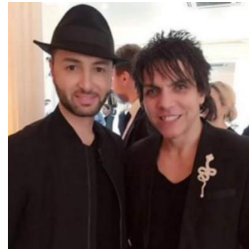
TV Presenter Bilal Al Arabi