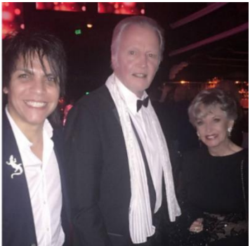
Angelina Joli's father Jon Voight and Tippi Hedren, Mélanie Griffith's mother