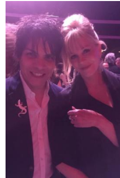
Actress Mélanie Griffith