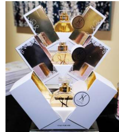
Package Design CITY Award, ICMA