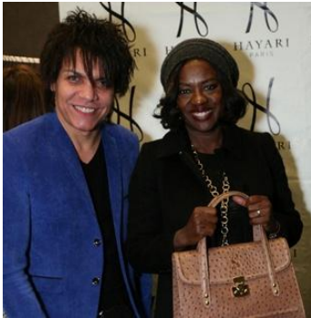
Actress Viola Davis, How to Get Away with Murder