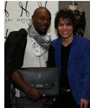
Actor Jimmy Jean-Louis alias Toussaint in the movie JOY