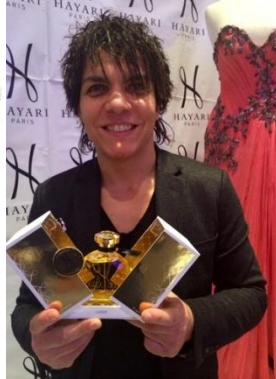
CNN iReport Golden Globes article