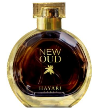
HAYARI PARIS, New Oud