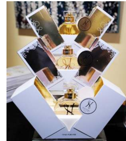
Package Design CITY Award, ICMA