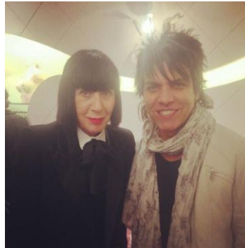
Designer Chantal Thomass