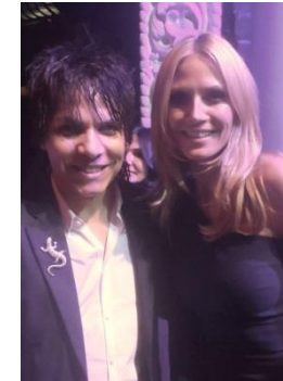
Model Heidi Klum