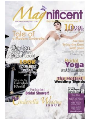
Interview Magnificent Magazine January 2016