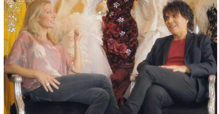
American Media Seductively French