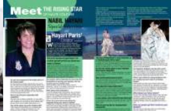
Interview Magnificent Magazine January 2016