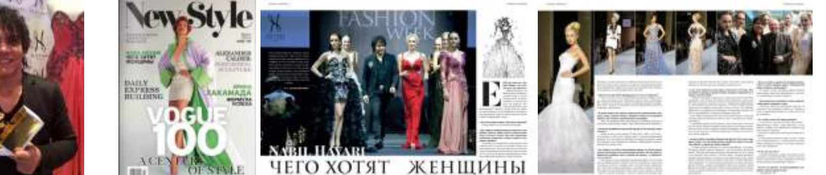
Interview New Style Magazine February 2016