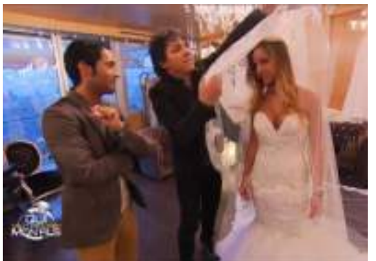
French TV Show Qui veut épouser mon fils?