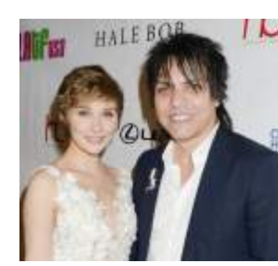
Actress Clare Bowen, Nashville