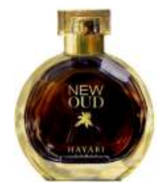
HAYARI PARIS, New Oud