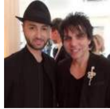
TV Presentor BilAl Al Arabi