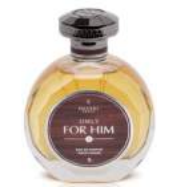
HAYARI PARIS, Only For Him

Masque Fragranze, Tango MDCI, Nuit Andalouse Suléko, *Albho Suléko, Baba Yaga Suléko, Djélem Suléko, Vy Roza Undergreen, Pink